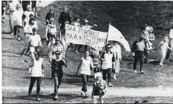
Images from demonstrations during the Phosphorite War